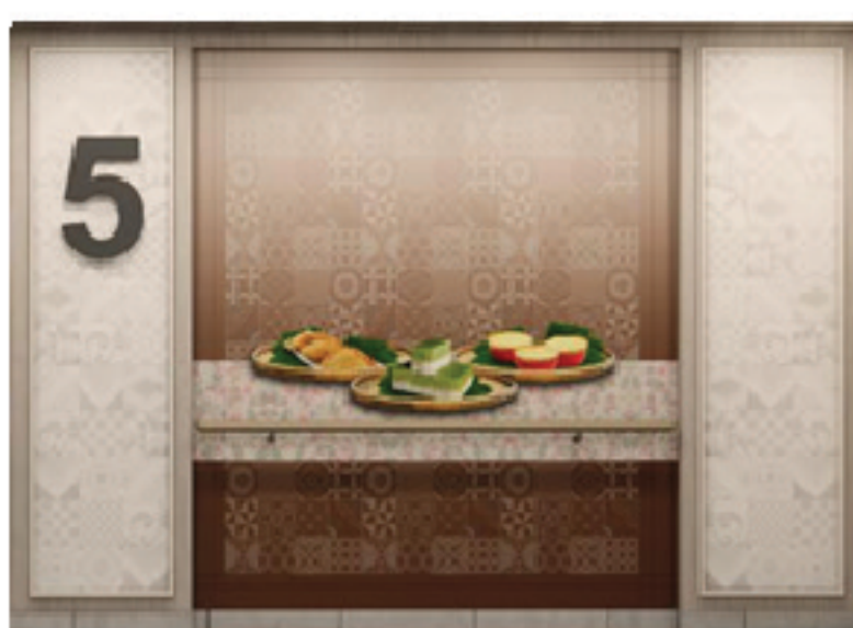
L5 Food (Brown)