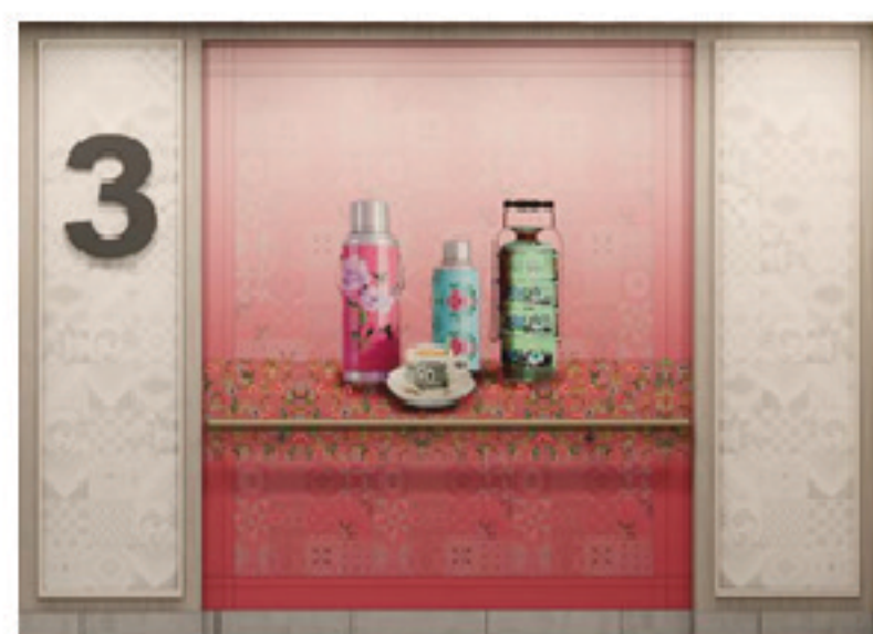
L3 Household Item (Peach)