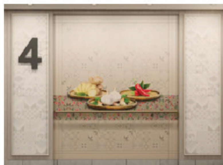
L4 Spices (Beige)