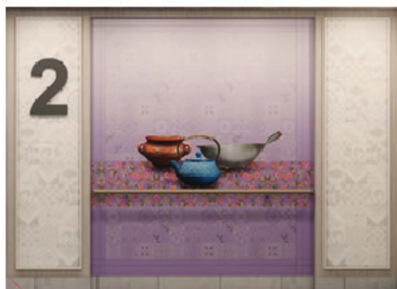
L2 Kitchenware (Purple)